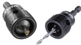
Black Label™ Smart Bit