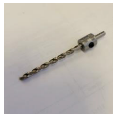
Fast Spiral Jobber Bit