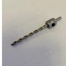
Fast Spiral Jobber Bit