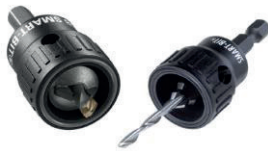
Black Label™ Pro-Plug Smart Bit