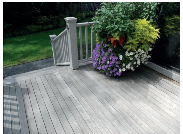
4" WIDE DECK BOARDS

It is primarily an aesthetic decision whether to use 6" wide (net 5.5") or 4" wide boards for a deck design.